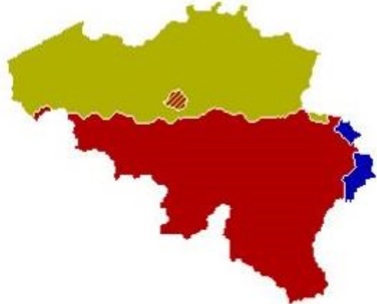
Map of the communities Deutch-speaking community (in green ) French-speaking community (in red ) Brussels-Capital region (where both communities have competences, streaked in green and red ) German-speaking community (in blue )