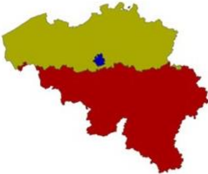
Map of the Regions Brussels-Capital region (in blue ) Walloon region (in red ) Flemish region (in green )